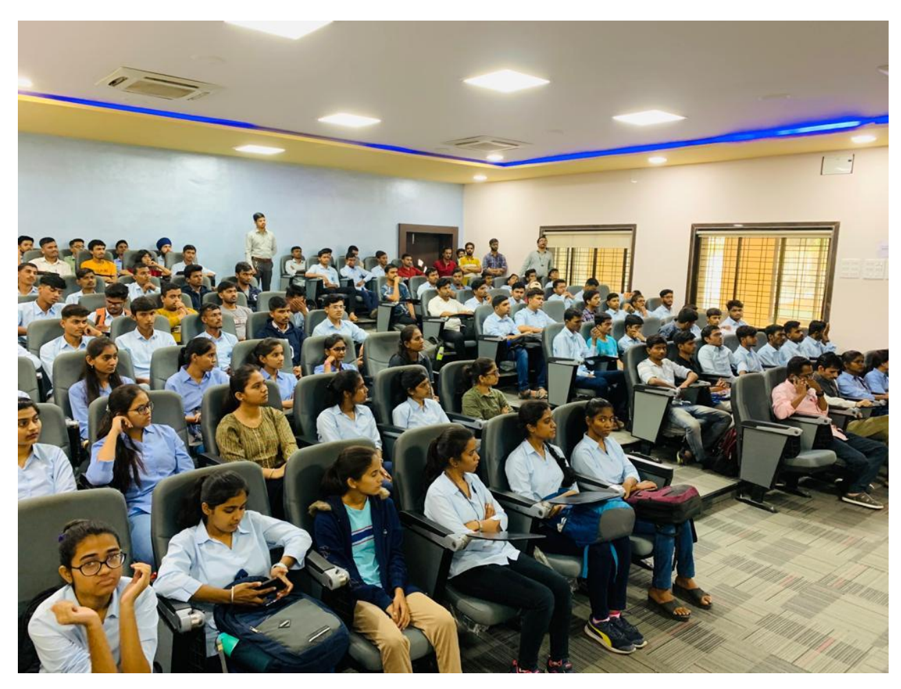
Students of the institute attending the event.