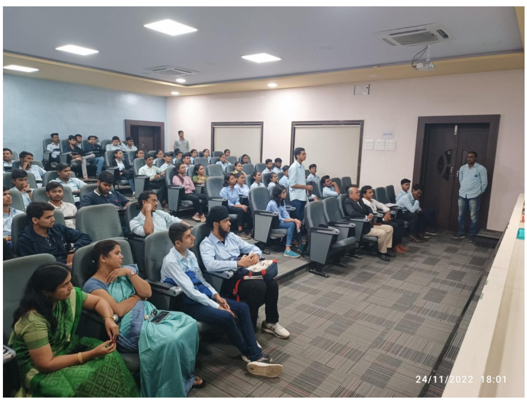
Snap of the audience