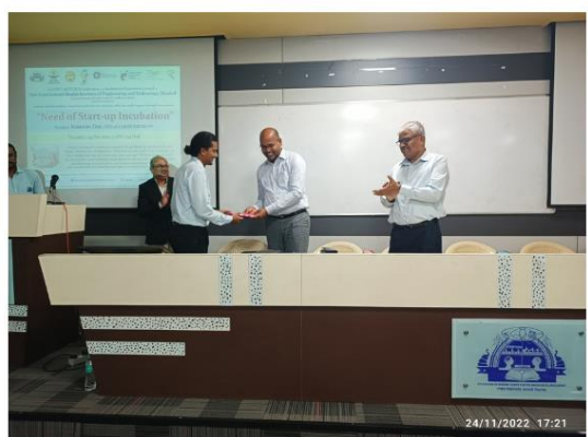
Collage of the event photos