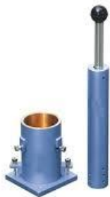
Proctor test Apparatus