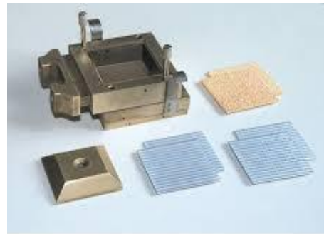
Shear box assemble