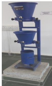
Le chatlier apparatus