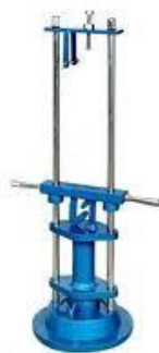
Aggregate Impact value apparatus