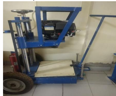
Pavement core drilling