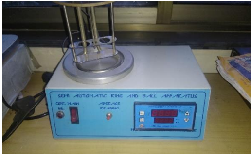
Ring and ball apparatus