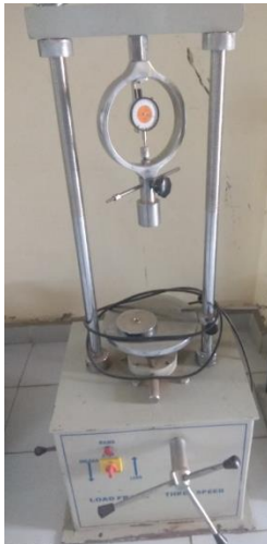
Flexure testing machine