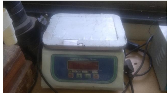
Table top balance